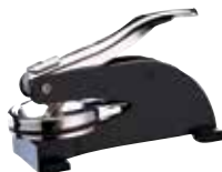
Classic Desk Style Seal