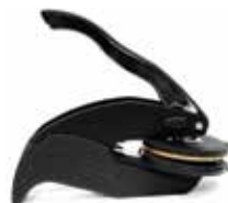
Dual Use Desk & Pocket Seal

Convenience of a self-inking stamp! Permanent, washable Ink! No Re-Inking mess, just switch the pad! Great for scrubs & bed linens